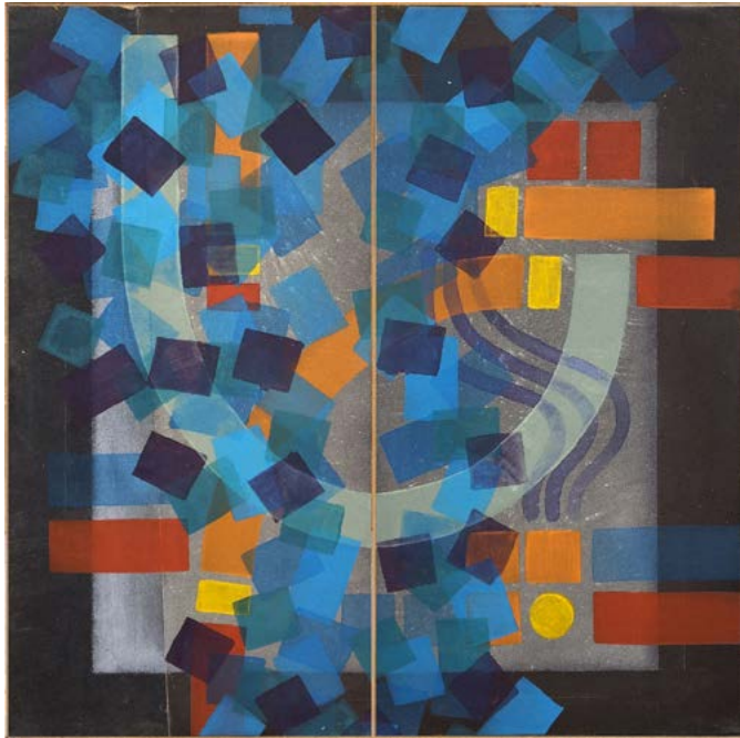
RENÉ MAYER Long Road, 2012 Acrylic on sandpaper mounted on wood board 180 x 180 cm

Shown publicly for the first time, the series Sandpaper (2012) is created on used industrial sanding belts, whose worn, abrasive surfaces become carriers of memory, resistance and time.