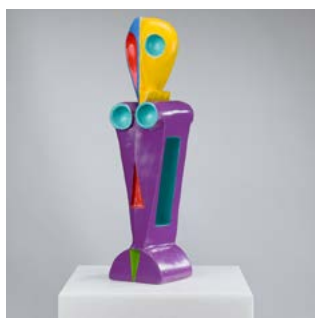
RENÉ MAYER Steadfast woman, 2018 Terracotta and Acrylic Viva Viva

These works are complemented by sculptures: Viva Viva , an expressive terracotta series full of rhythm and collective energy, and Marmor & Granite , in which reduced forms incorporate themes such as relationship, duality and balance.