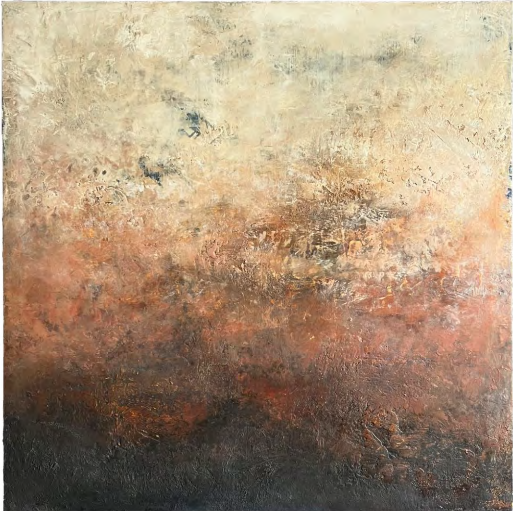
Martin Lechner: #00670316 / Oil on panel, 90x90cm, 2016

LAC Lagorio Arte Contemporanea Marco Lagorio Via Fratelli Bandiera 17b, I-25122 Brescia +39 338 695 17 51 www.instagram.com/laclagorioarte