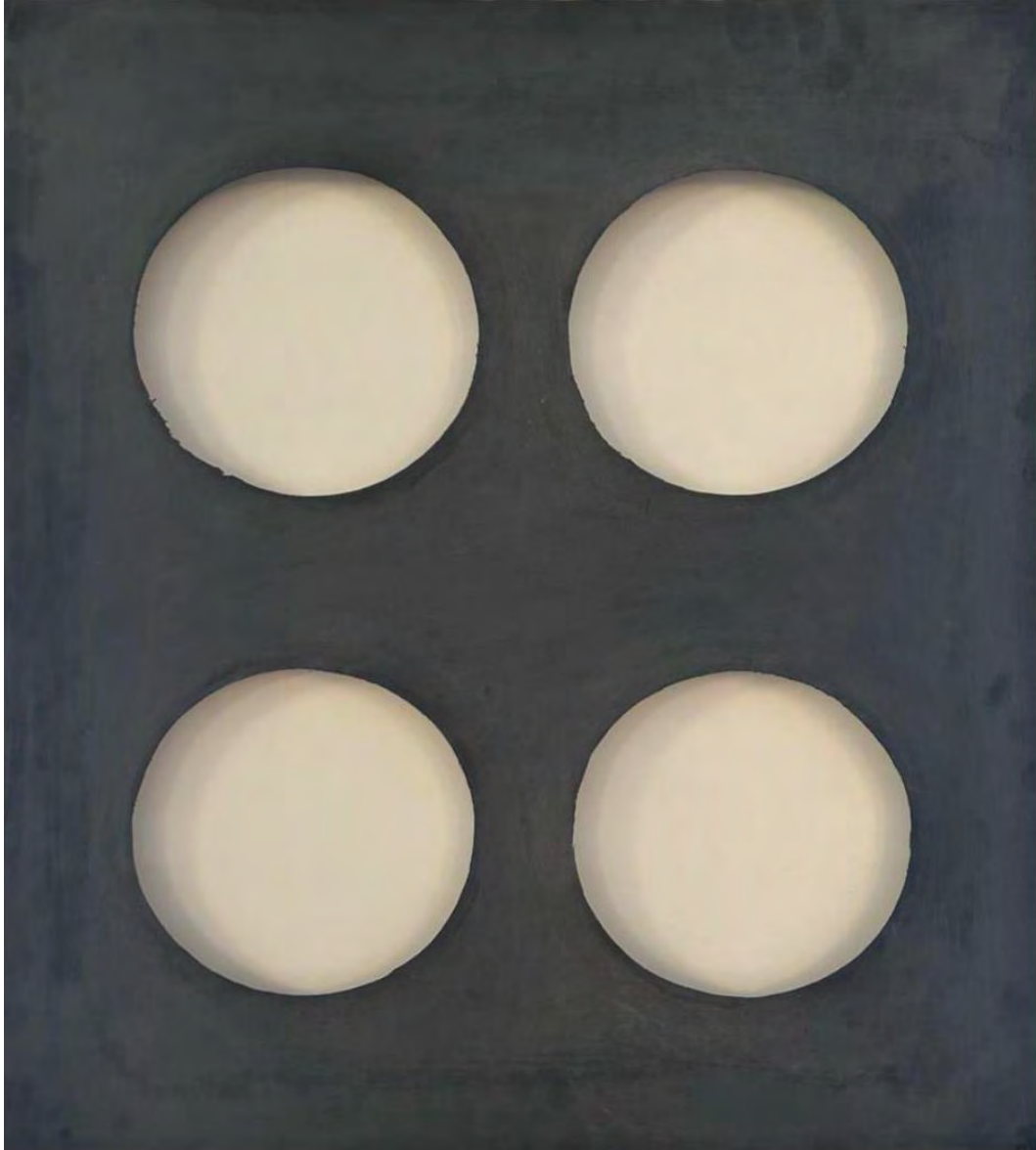
Dadamaino: Volume / Water paint on canvas, 70x60cm, 1960