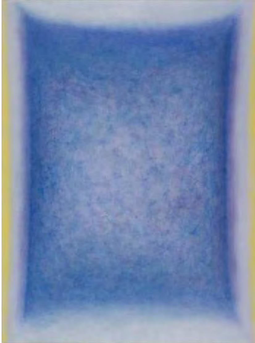
Raffaele Cioffi: Soglia giallo blu / Oil on canvas, 200x150cm, 2022