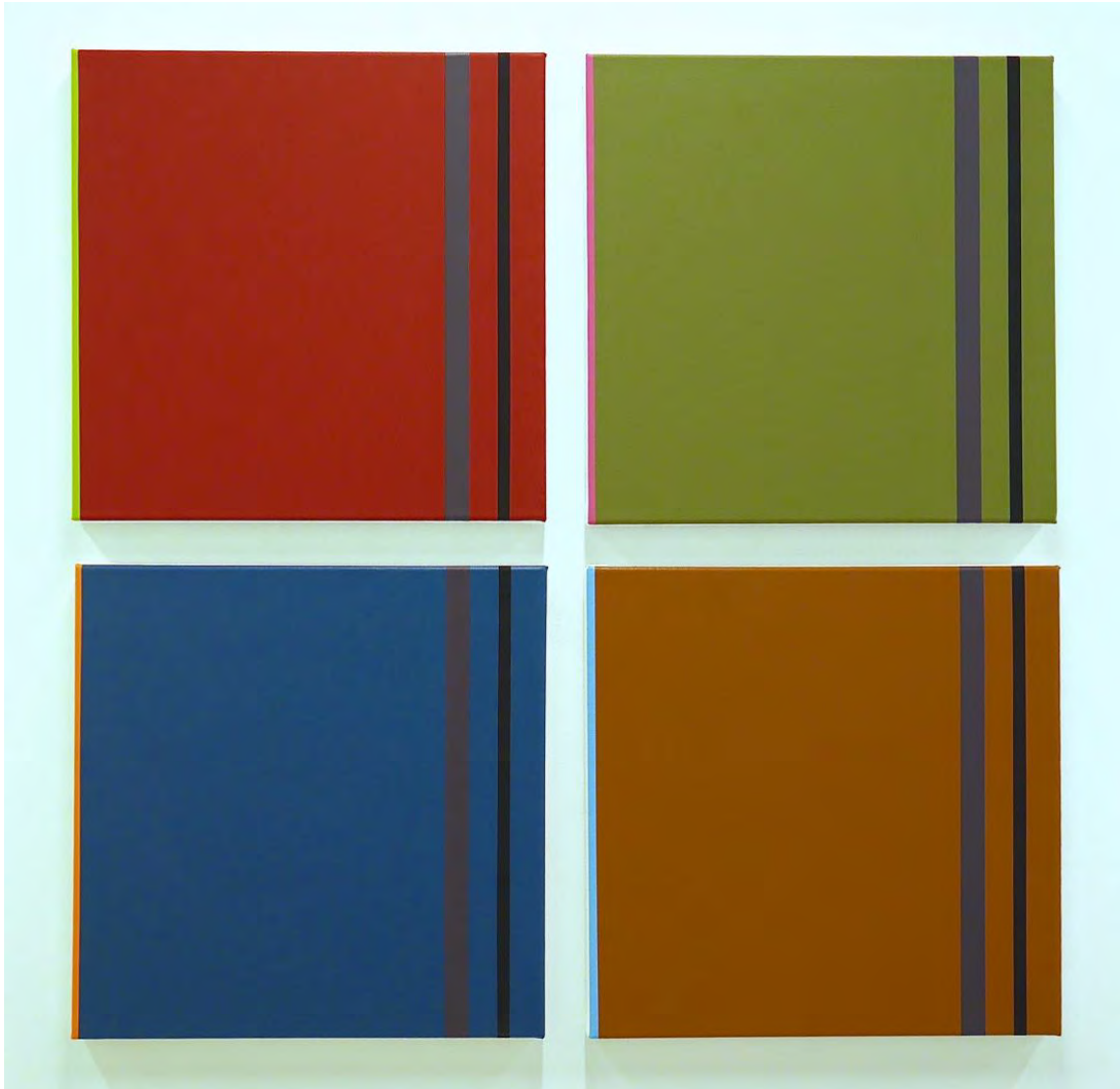
Philippe Chitarrini: Untitled / Matte and satin acrylic on canvas, 40x40 cm each (polyptych), 2021