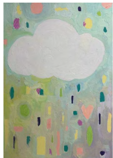
Ying Handler: Universum-Kollektion #1 / Ölstift, Ölfarbe auf Papier, 29,7x42cm

Die Kollektion Universum von Ying Handler ist von der Welt der Meditation des Ying inspiriert und setzt sich in erster Linie aus leuchtenden Farben und ausdrucksstarken Grafiken und Symbolen zusammen. Liebe und Hoffnung stehen im Mittelpunkt der Serie.