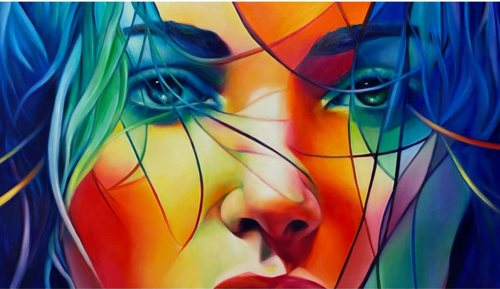
H. Kłopotowska Missing oil on canvas 80 x 140 cm 2021