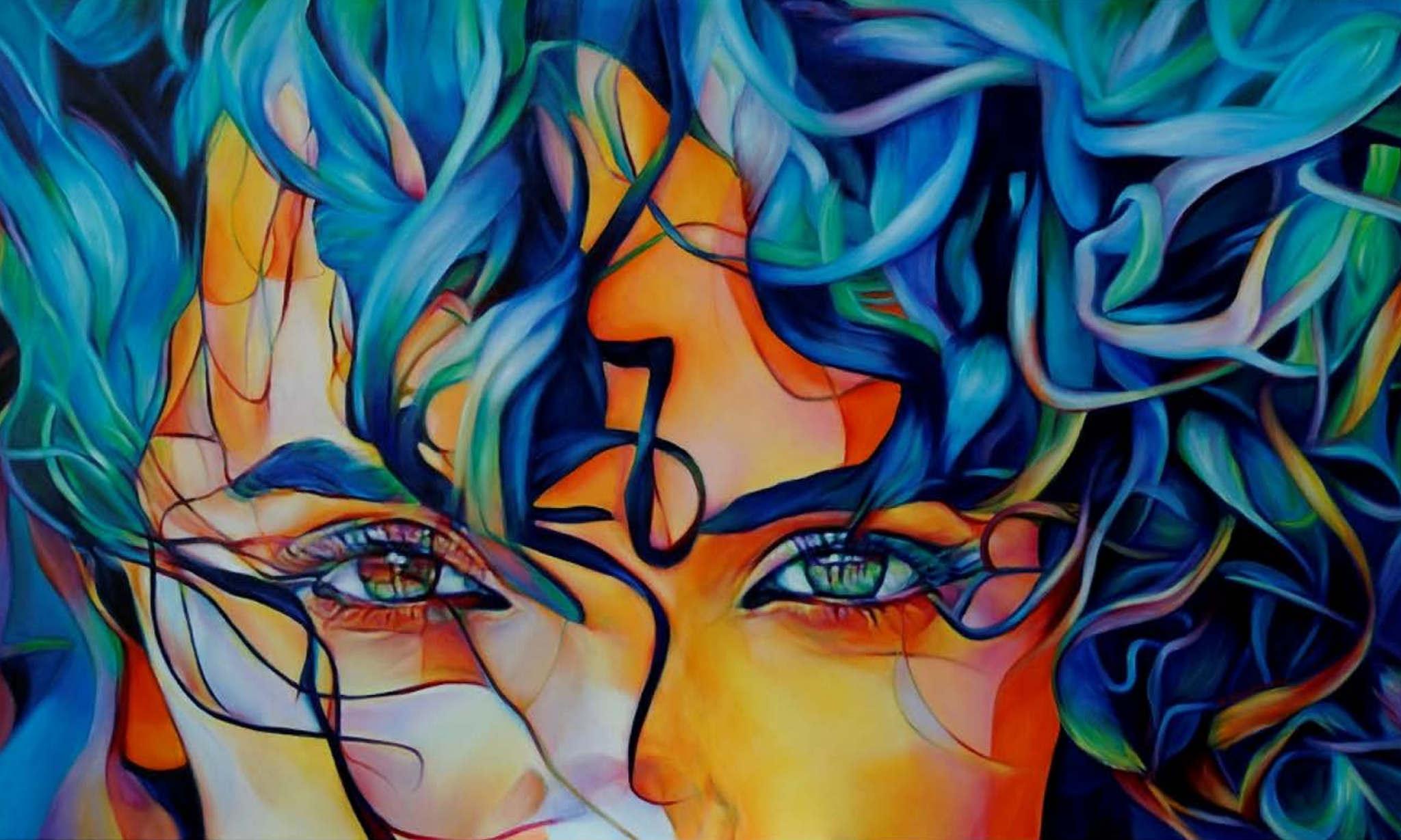
H. Kłopotowska You - Me oil on canvas 90 x 150 cm 2021