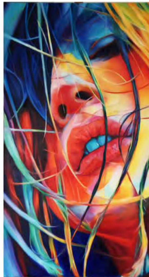
H. Kłopotowska Love me tender oil on canvas 125 x 70 cm 2022