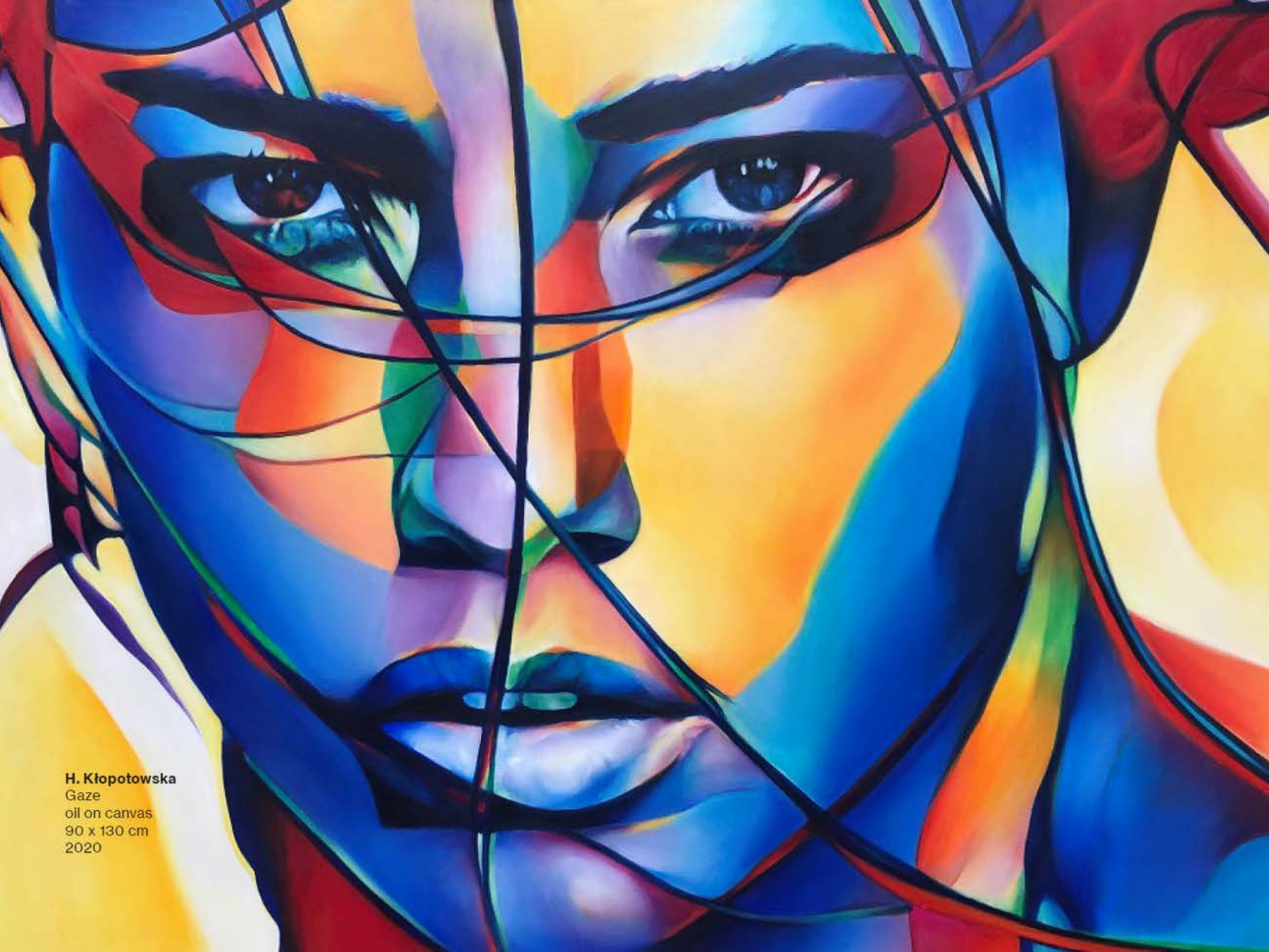
H. Kłopotowska Gaze oil on canvas 90 x 130 cm 2020