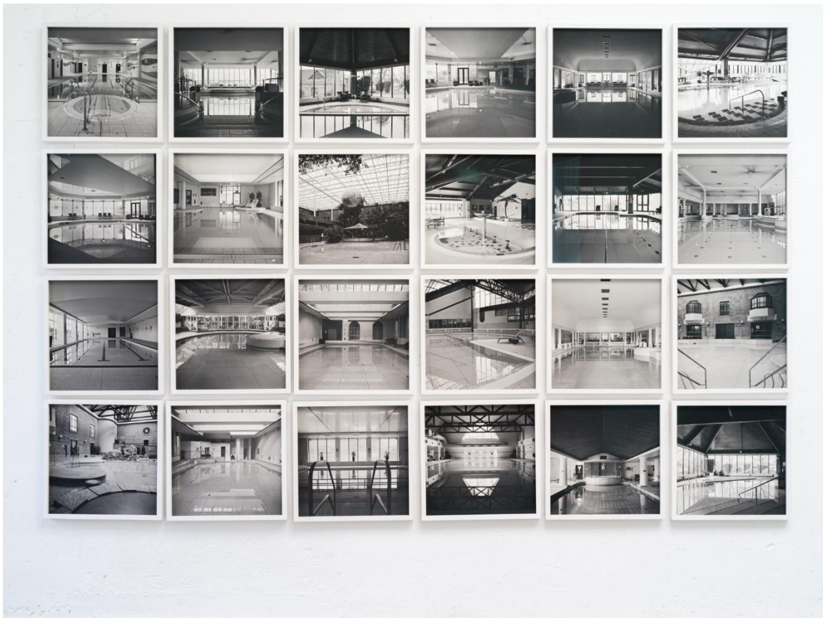
Anna Dobrovolskaya-Mints: Somewhere to Swim. Panel / Photography, 24 framed works, Edition 1/3, 2021 / White frames, b&w prints, anti-reflex glass 70%, 50 x 50 cm (54 x 54 cm with frame)