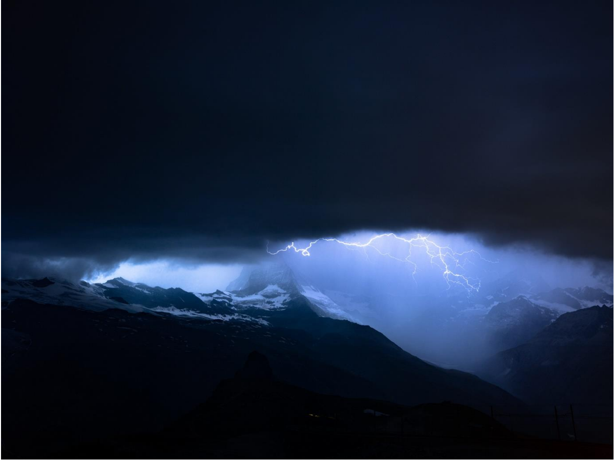
Anna Dobrovolskaya-Mints: ADM0109 / digital photography, 2019 / 100x134cm (110x144cm with frame)

The artwork is a part of Zero F*cks Given project.